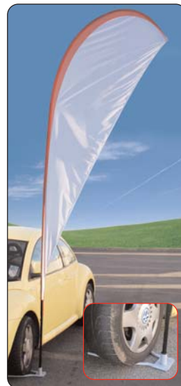
Drive-on Car foot option