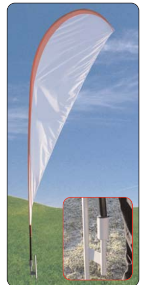
Ground stake option