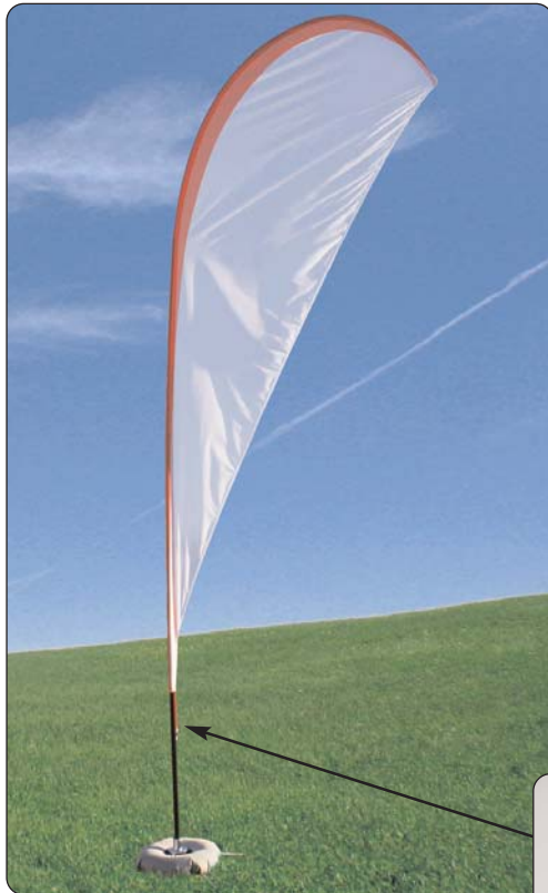
Weighting ring option