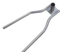
Drive-on Car foot