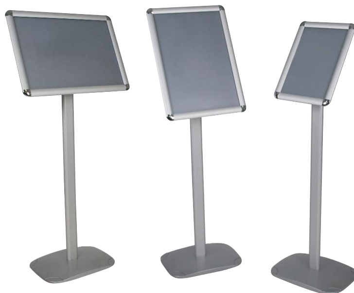
Sentry A3 (landscape)

Loosen wing nut and rotate frame to convert between landscape and portrait format.